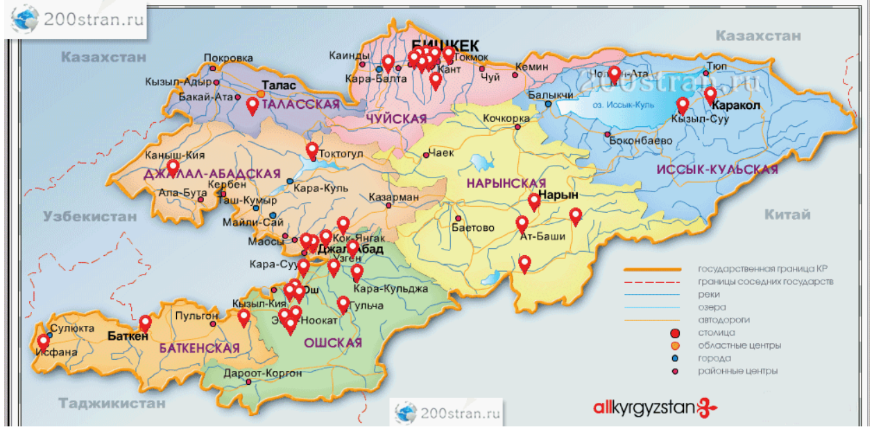
Figure 2. Distribution of Hospitals Supplied with Liquid Oxygen across the Regions of the Kyrgyz Republic

Although liquid oxygen is used in health facilities throughout all seven regions of the country, as shown above, use is most concentrated in densely populated urban areas. Most liquid oxygen