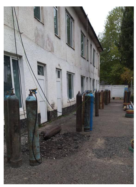
Image 1. In Jalal-Abad, relatives of patients in the oblast hospital supply oxygen themselves to the wards

In the Kyrgyz Republic, the number of health care personnel and staff-to-patient ratios are regulated by the MOH. As reported by interviews with MOH staff, the typical staffing structure of health care facilities is one physician for six patients and one nurse for two patients. While these