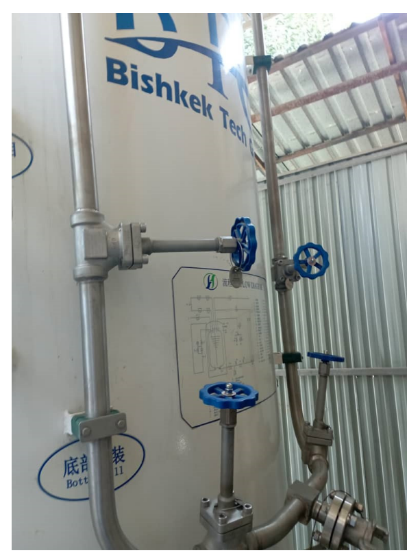
Image 3. Tank for the liquid oxygen gasification process installed in the Infectious Disease Hospital in Osh

This study interviewed all 35 government facilities with liquid oxygen supply systems. The findings below outline respondent perspectives