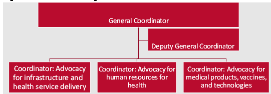
Figure 2: National-level organizational structure of REBAS-TL

The finalized REBAS-TL ToR propose the national-level leadership structure depicted in Figure 2. This structure includes a General Coordinator, a Deputy General Coordinator, and three Thematic Coordinators. The General Coordinator was onboarded in May 2022 and has been performing his role as the national convenor. The Activity co-convened a national level workshop on 23-24 June 2022. The internal structure of REBAS-TL was finalized during this workshop, during which three Advocacy Coordinators were elected to plan health advocacy efforts for specific areas and cross cutting areas of health system strengthening.