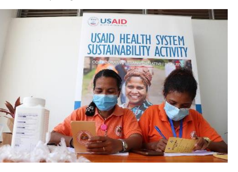
Municipality Health Workers register vaccination data during a community campagn for COVID-19 screening and vaccination in Memo Village, Timor-Leste.

motivating factor to both join and stay in their CHW role.<sup>36</sup> Gender is another social factor that intersects with career progression opportunities. A study in Afghanistan found that female CHWs face significant barriers to promotion and were often sidelined for career progression opportunities due to harmful gender norms and limited access to education, impacting their motivation.<sup>37</sup>