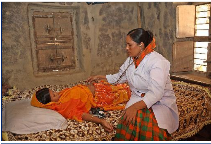
A CHW checks on a pregnant mother's health condition as a part of her daily door-to-door duty in Gazipur, Bangladesh.

Countries also have advanced practice and education opportunities that are not linked to formal career pathways. These opportunities offer in-service upskilling, advanced training, and scholarships to CHWs. Affording such opportunities serves to strengthen CHWs' technical capacity, increase professional value and status, and potentially support transition to another health worker role. These kinds of opportunities are available in Botswana, India, Liberia, Uganda, and United States.<sup>19,20,21,22,23</sup>